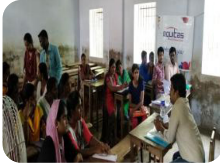
Jobfair at Trichy