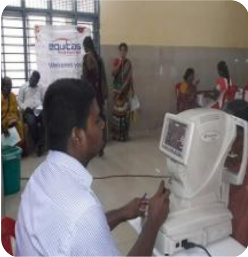
Eye screening camp was conducted at Chennai corporation hospital, Vallalar Nagar, totally 130 members benefited and 32 spectacles were issued.