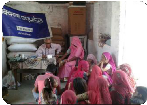
Health camp at Pali, Jodhpur area