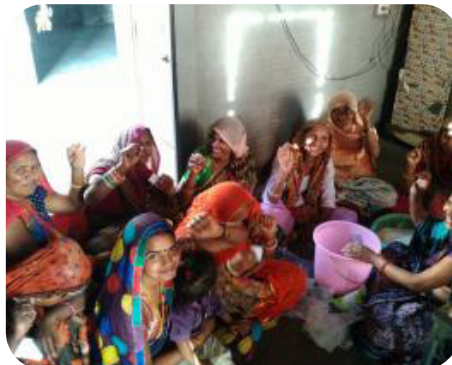
Liquid soap making training at Sapphire, Rajasthan