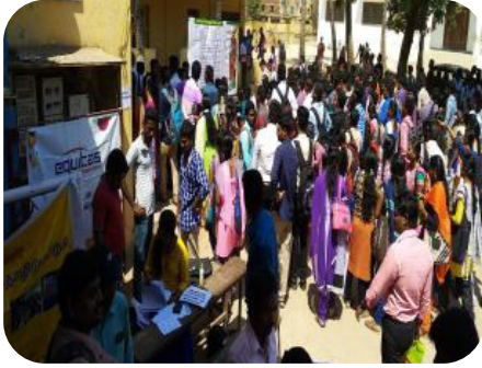
Jobfair at Thiruvottriyur, Chennai

Equitas conducts jobfair for the unemployed youth to get employment opportunities, this helps the unemployed youth to pick & choose the job he/she likes. A regular path is created for the jobseekers to continue thier career, and uplift their social status