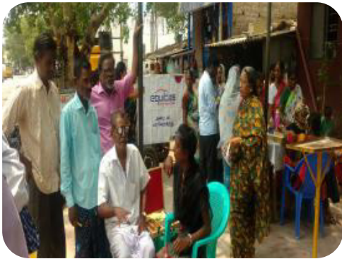
Eye screening camp at Ashok Nagar, Chennai

By facilitating early detection of diseases through screening camps as well as by helping through secondary care to reduce the treatment cost, Equitas helps communities hailing from the "Bottom of Pyramid" to get rid of the burden of spending huge portion of their hard earned money on health problems.