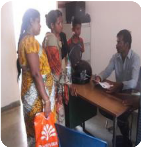
Two of our EBN Member's children were helped to get admission in hostel Rotary Boys. Town, Supported by Rotary Club of Madras.