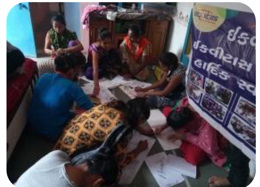
Beautician training at Bapunagar, Ahmedabad