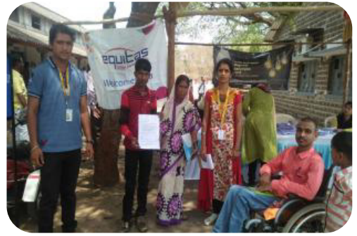
Jobfair for differently abled at Pune, Maharashtra