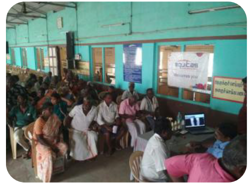
Ortho-camp at Viruthachalam, Mailaduthurai area