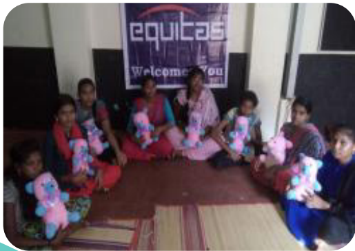
Doll making training at Chintaripet

Equitas strives for the enhancement of quality of women's lives by providing skill trainings and empowering them to earn supplemental income. This also gives economic independence to women and ensures their participation in the economic development of our nation.